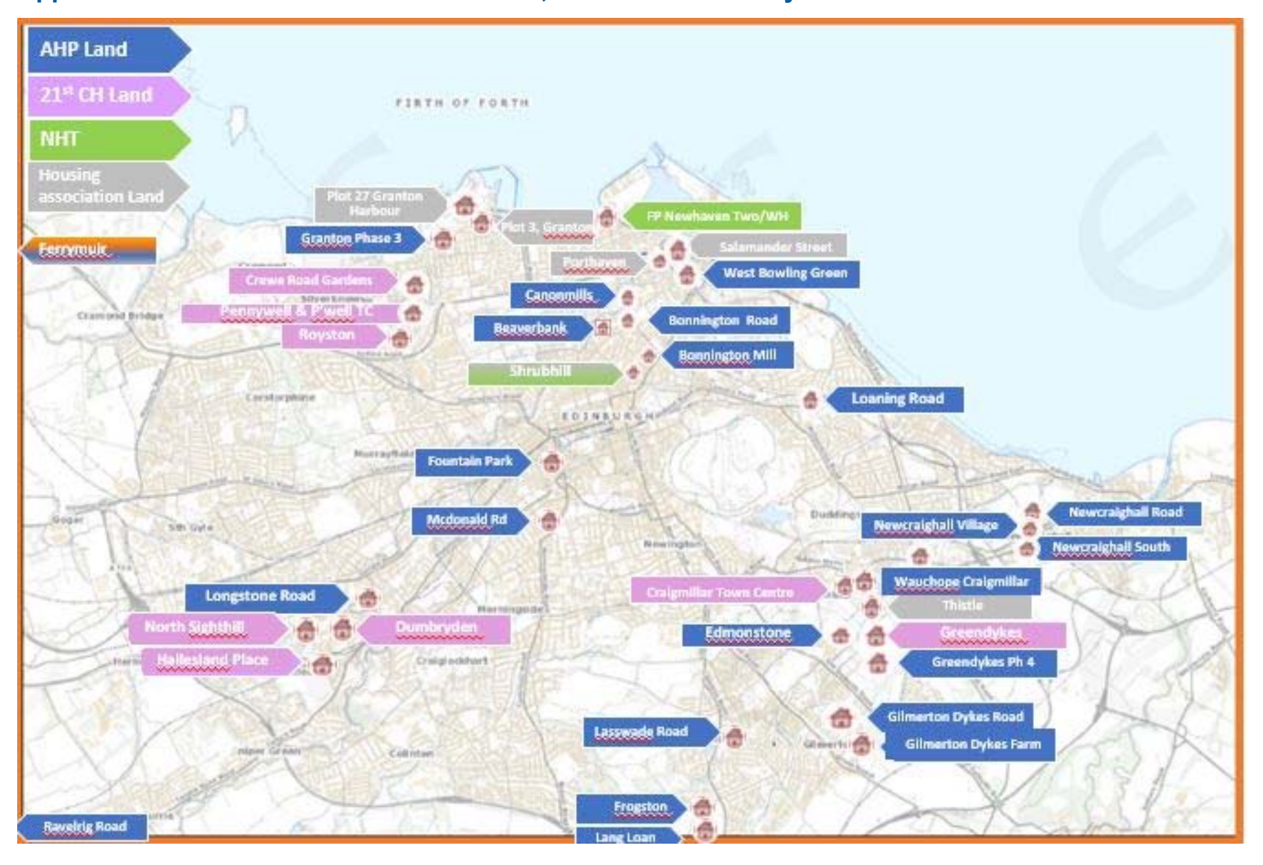
Appendix 1 – Homes under construction: 2,296 homes currently under construction on 38 sites